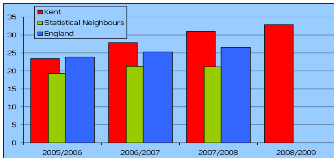
Table 6 – Children subject to a CP Plan per 10,000 populations (0-18 year olds)

A policy decision in 2007 to ensure increased scrutiny and focus on child protection plans in order to prevent plans being ended prematurely may have had some impact on the increasing numbers of children subject to a plan. Other factors, such as the heightened awareness and publicity following Haringey, the recession, the introduction of the Public Law Outline in 2008, and the high social worker vacancy rate may all have contributed to the increasing numbers of children subject to a child protection plan across the county.